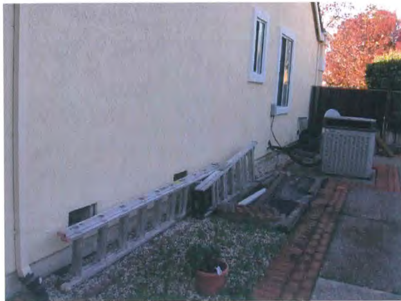
LEFT VIEW, TAKEN FROM REAR