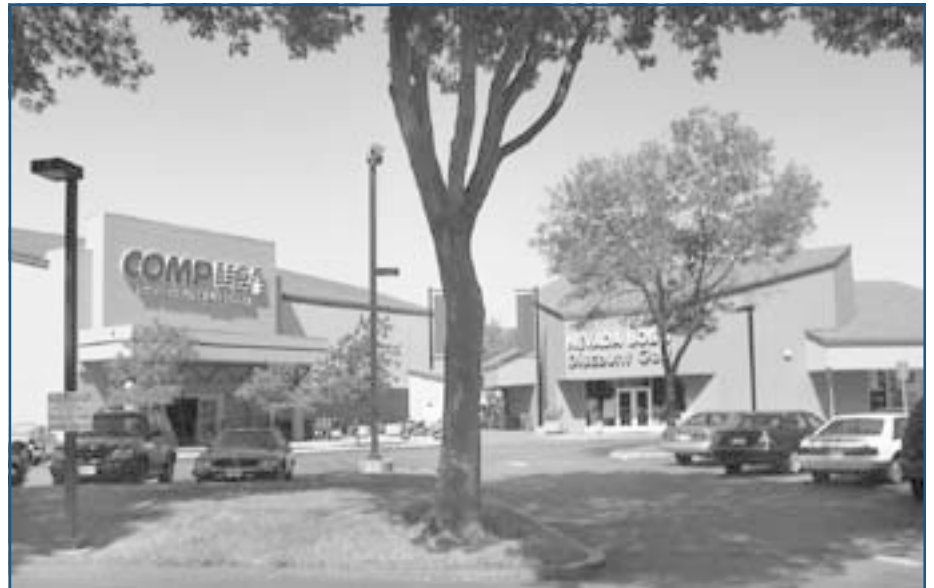
CompUSA and Nevada Bob's in the Willows Shopping Center

Sunvalley is one of Northern California's largest shopping centers