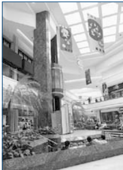
Sunvalley Shopping Center