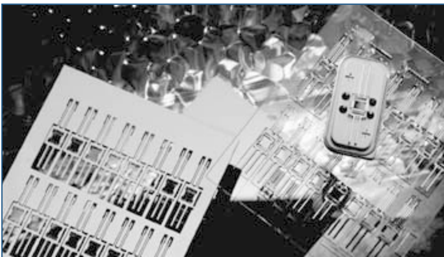
Systron Donner gyrochip