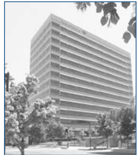
Bank of America Technology Center

In addition to the Bank of America Technology Center, Concord is also the home to a number of other companies whose businesses involve cutting-edge technology. Concord offers these companies a number of advantages. One advantage is Concord's central location in