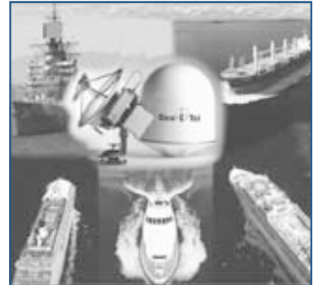
Sea Tel stabilized antenna platform

Cerus Corporation is a world-renowned biopharmaceutical company that was formed in Concord in 1991. The company has developed a revolutionary technology that is designed to strip viral and bacterial infections from donated platelets, plasma and red blood cells that are used in blood transfusions. Cerus is also pursuing therapeutic applications of this technology to treat and prevent other serious diseases, such as sickle cell anemia. Cerus recently received approval from the European Regulatory Commission to market its Intercept Blood Purification System for platelets. This approval marks the culmination of more than 10 years of work by Cerus and its partner, Baxter International. The approval is expected to be the first of several